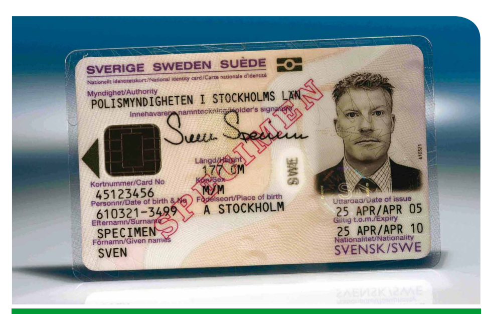
The quality, the reliability and the perceived value of an identity card (in this instance the polycarbonate Swedish ID card) all help to build confidence and facilitate adoption.

The smart card (microprocessor) is considered to be the most secure means of authentication, making it possible both to prevent identity fraud and protect citizen's personal data in an effective way. It is the media of choice for granting access to e-Government applications. It can also be used as a means of hosting a range of other applications (e-payment, e-purse, digital signature, authentication, identification, travel card, etc.). This potential to provide a range of different services on a single format means a